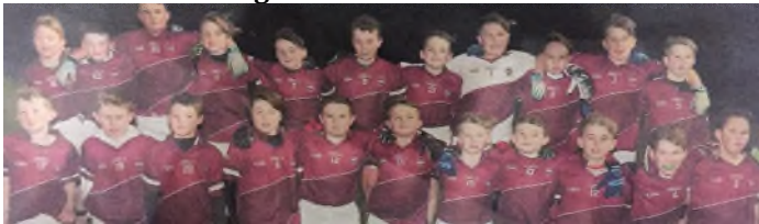
Rackard League Roinn B Title Holders