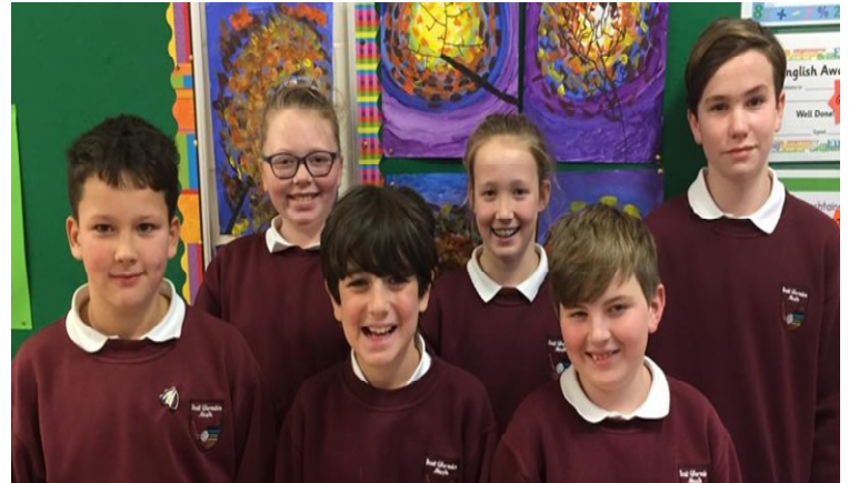
Victorious Debating Team