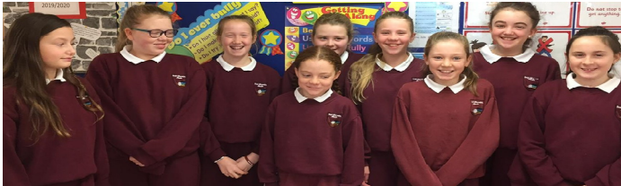
Rising Star GAA Semi-finalists