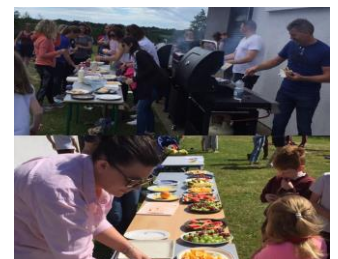
Parents' Association helping out on Sports Day