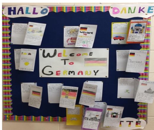
Information Brochures About Germany - 4 th & 5 th Class