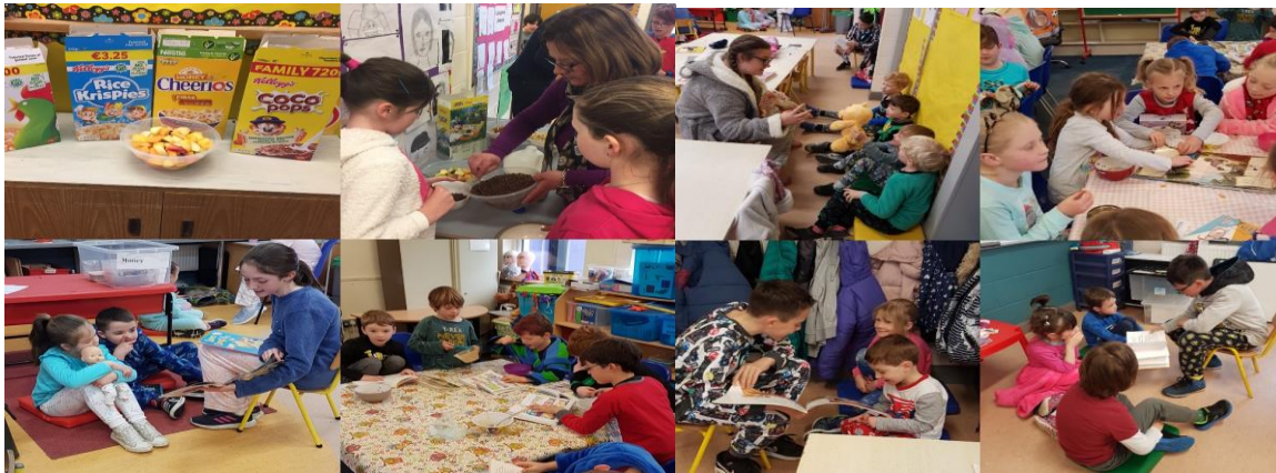
Buddy reading, pyjamas wearing, cereal eating kind of day!