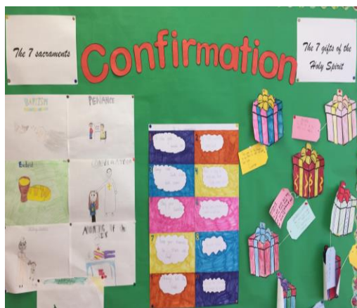
Confirmation Preparation - 5 th & 6 th Class