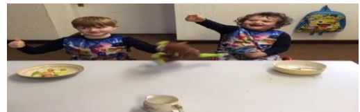
All the boys loved pyjama day and think it should be a regular occurrence!