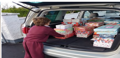
Look at how many Shoeboxes we collected in our Shoebox Appeal! (See Page 4 for more details)