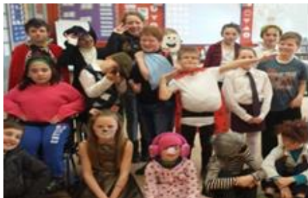
Getting ready for the catwalk!