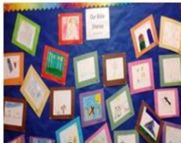
Our Bible Stories