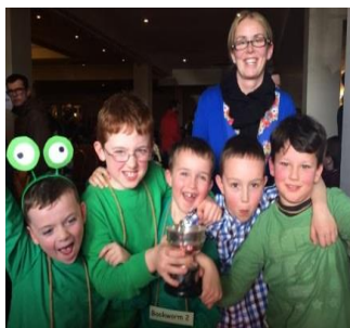
Celebrating our win!