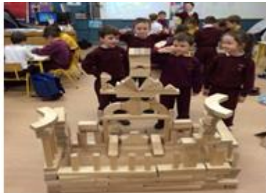
Fun with Jago Blocks!