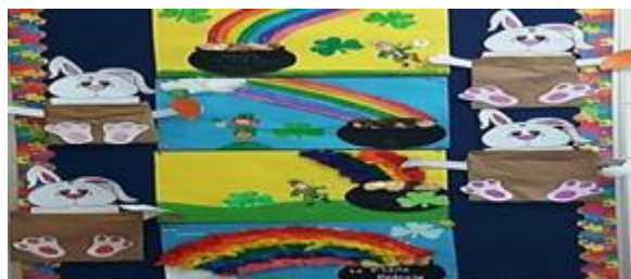
Our Easter and St. Patrick's Day Art Work

History/Geography/Science: We have been learning lots of interesting things in the above subjects. To name a few things; we have learned about the Easter Rising and on International Women's Day in March we focused on the contribution of Cumann na mBan to the Rising. We are currently exploring Wexford's participation in the Rising. We explored change and continuity in Geography focusing on transport and an example of Science work we explored Sound.