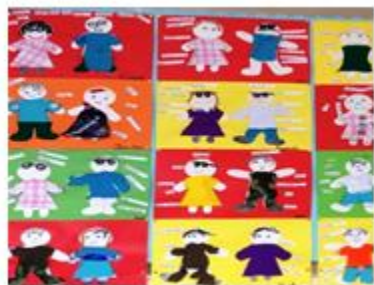
We think our Grandparents are.....

On Wednesday 3rd February we celebrated Grandparents' day . This provided us with a lovely opportunity to remind our children the important role grandparents play in their lives. We had a very enjoyable day, one that will hold great memories for both the grandparents and children in the years to come. Many thanks to the grandparents, parent and relatives who visited us in the school to experience some of the present and give us an insight into some of the past.