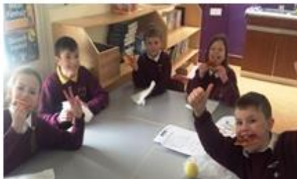
Feb Class of the Month!

In Maths, we took a very hands on approach to learning about Fractions . We used real bars of chocolate to show different fractions. Who knew that Maths could be so tasty??