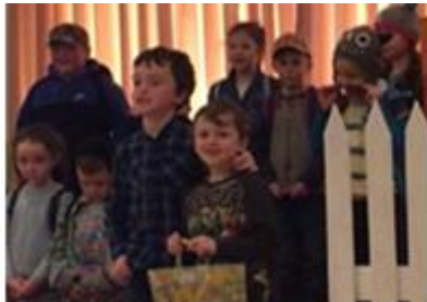
Arklow Music Festival