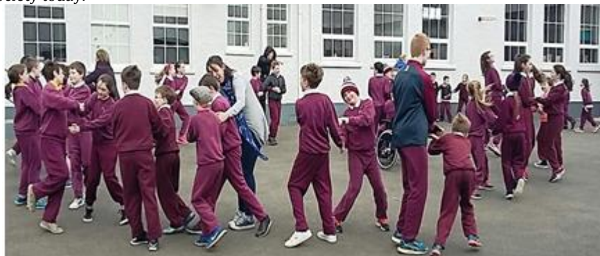
Everyone enjoying the Ceilí on Proclamation Day

SPHE: We were very excited to begin the pilot SPHE programme called 'All together Now.' Scoil Ghormáin Naofa is one of just a few schools taking part in this pilot programme and we will be named as participants in the study and research when it goes public to all schools. The programme covers issues such as bullying and discrimination, attitudes in relation to respecting diversity and difference; and the fostering of dispositions of respect and inclusion in society today.