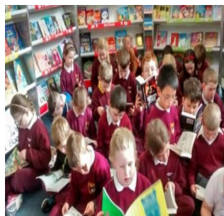
School Book Fair